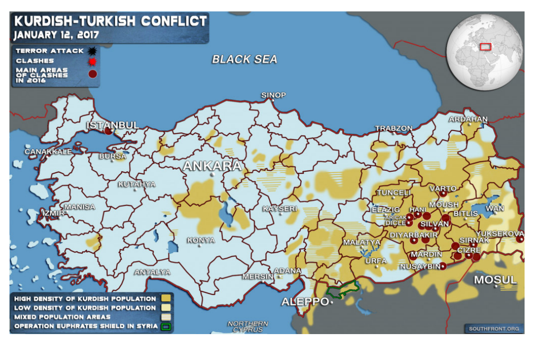
Figure 2: Kurdish- urkish Map 2017

Mustafa Kemal Ataturk was the leader of a revolutionary process of reconstructing the country in a manner that the process was called 'Turkification'. The nation building process the Kurd discontent population was crushed at all fronts wherever they tried to raise their voice as an ethnic group having challenged identity and deprived conscious. The 'Kemalist' ideology involved cleansing of all the other ideologies including Kurdish identity and merging it into the Turk nation as a whole. The Kurds were given the status of 'Mountain Turks' which was strongly opposed by the Kurd ethnic masses as they faced deep regression in their own country. During the next 80 years, any move that was taken by the Kurds as a manifestation of aggression and violence resultant of the negation of the right of territorial determination was brutally quashed. It was in 1978 that the Kurds finally took arms against the Turkish state and formed the Kurdistan Workers Party PKK (Partiya Karkerên Kurdistanê) and the beginning of armed conflict was evident.